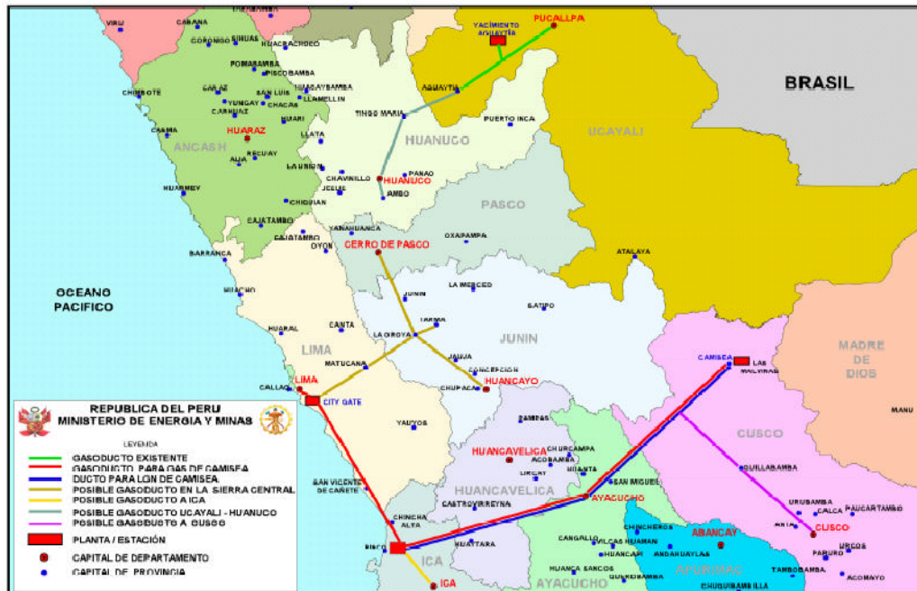
Figure 1 Peru Gas Pipelines Development