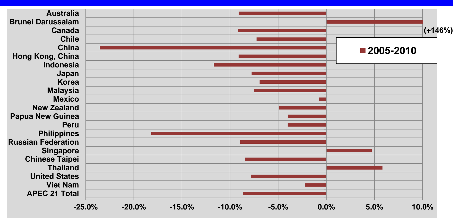
EWG44 11.d. Energy Intensity Reduction Goal - 6/6