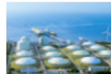
Sodegaura LNG Terminal