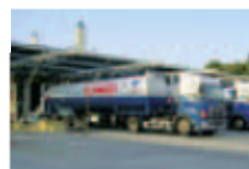
LNG tank lorries