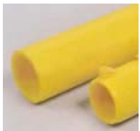
Low-pressure pipeline (polyethylene pipe)