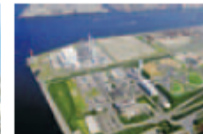
Ohgishima LNG Terminal