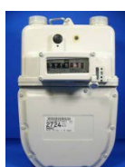
Gas intelligent meter