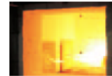
Regenerative burner system