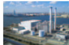
Ohgishima Power Co., Ltd.

Overseas Upstream and Downstream Business