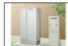
"ENE-FARM" residential fuel cell system